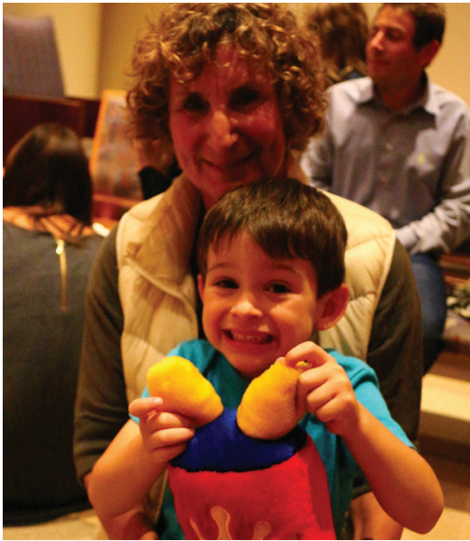
Tot Shabbat 10.4.2019