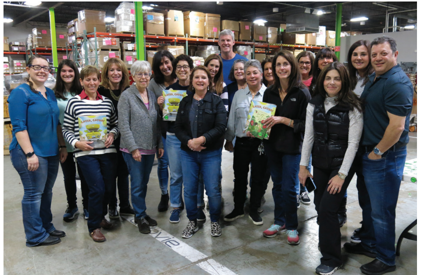
Group Volunteering at Bernie's 10.14.2019