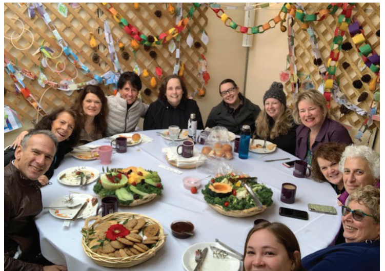
Staff Lunch in the Sukkah 10.15.2019