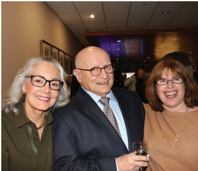
60th Anniversary Celebration 11.2.2019