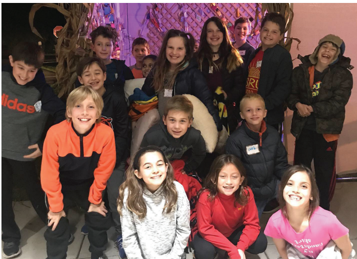
Club 345 Movie in the Sukkah 10.19.2019