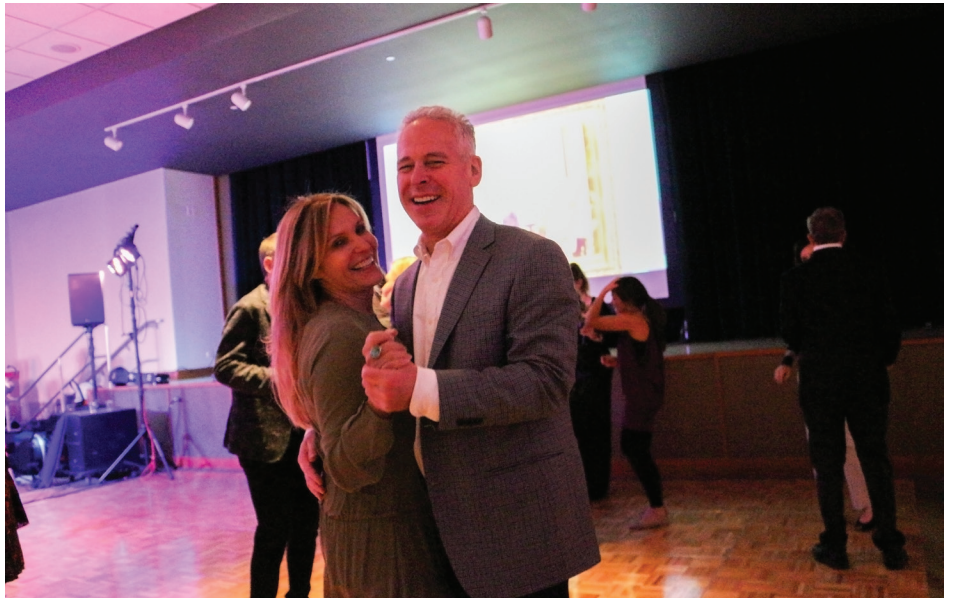
60th Anniversary Celebration 11.2.2019