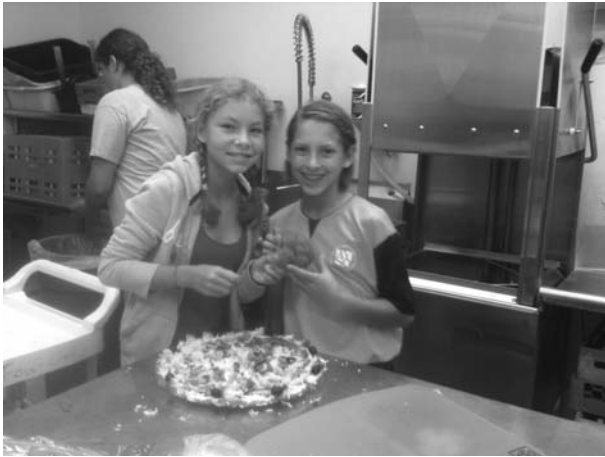
Jr JeTY members showed off their cooking skills at the Top Chef Extravaganza!