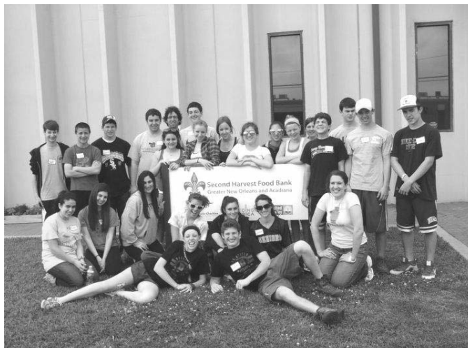
Alternative Spring Break in New Orleans