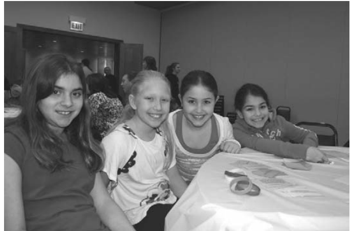
Some of our 4th graders at our creative prayer service