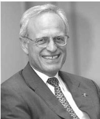
Ambassador Martin Indyk led our Stanley Golder Interfaith Lecture Series