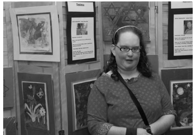
The Keshet Art Fair was a huge success thanks to the Keshet students and the Social Action Committee