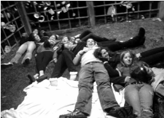
Our JeTYites gathering in the Sukkah