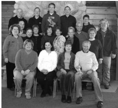
2011 Adult Retreat: "The New Zionism or...How a Good Reform Jew Can Be A Lover Of Israel"