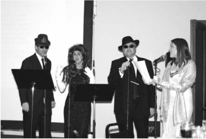
Our staff entertaining guests at our Adults-Only Purim Party