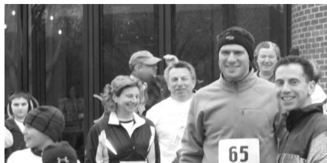
Runners and walkers get ready for a workout at the 2 nd Annual Shushan Shuffle, part of Temple Jeremiah's Purim celebration.